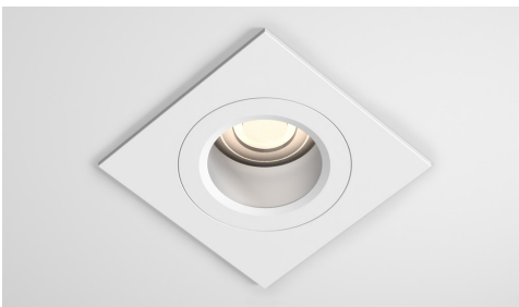
ALL WHITE (RAL9016)