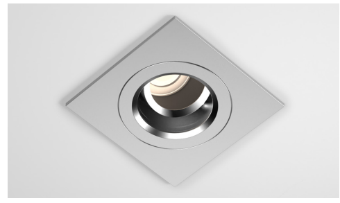
ALL WHITE (RAL9016)