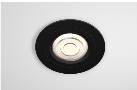
BLACK (RAL 9005)