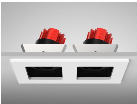
WHITE (RAL 9016)