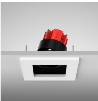
WHITE (RAL 9016)