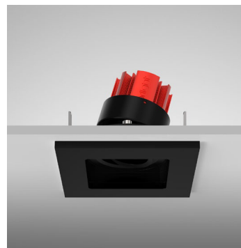
BLACK (RAL 9005)