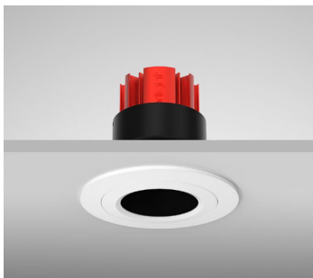
WHITE (RAL 9010)