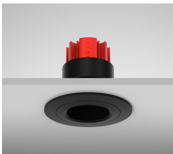
BLACK (RAL 9005)