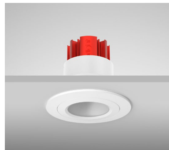
ALL WHITE (RAL 9010)