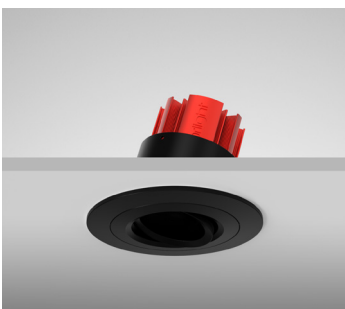
BLACK (RAL 9005)