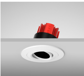
WHITE (RAL 9010)