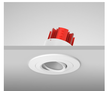
ALL WHITE (RAL 9016)