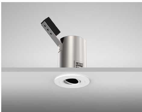
WHITE (RAL 9016)