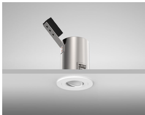
ALL WHITE (RAL 9016)