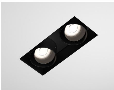
BLACK (RAL 9005)