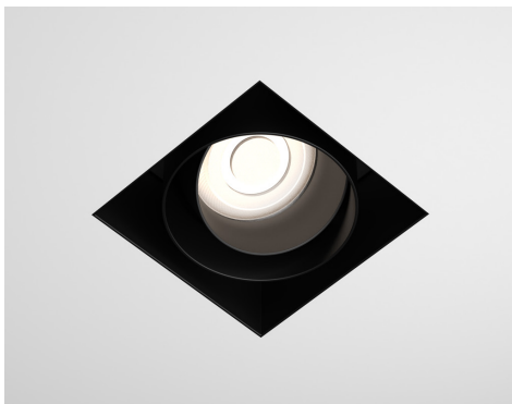
BLACK (RAL 9005)