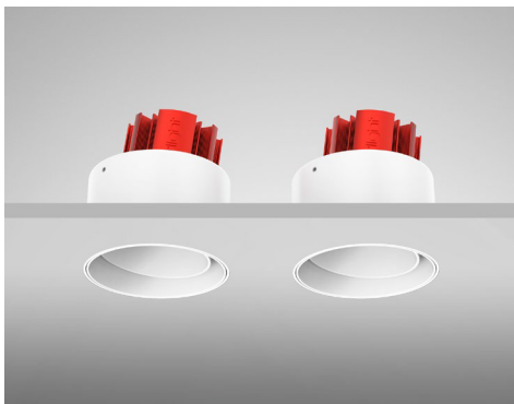
ALL WHITE (RAL 9016)