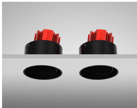
BLACK (RAL 9005)