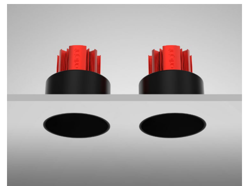
BLACK (RAL 9005)