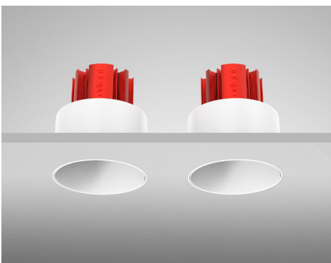
ALL WHITE (RAL 9010)