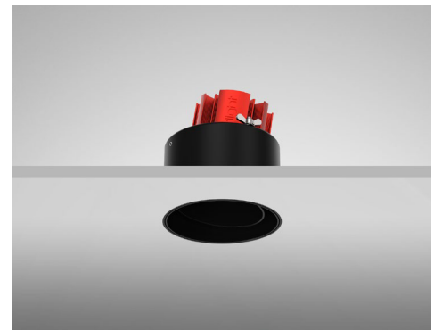
BLACK (RAL 9005)