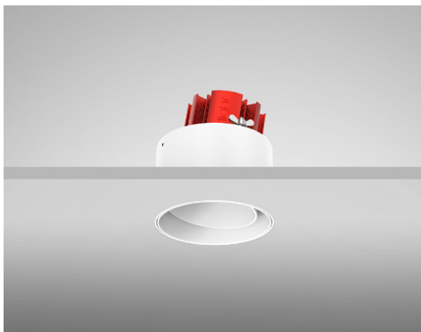
ALL WHITE (RAL 9010)