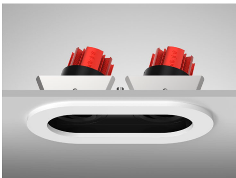
WHITE (RAL 9016)