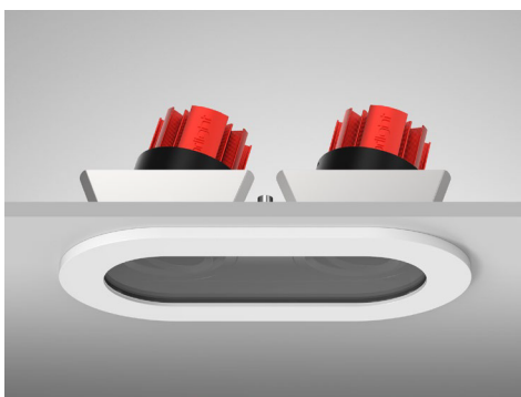
WHITE (RAL 9016)